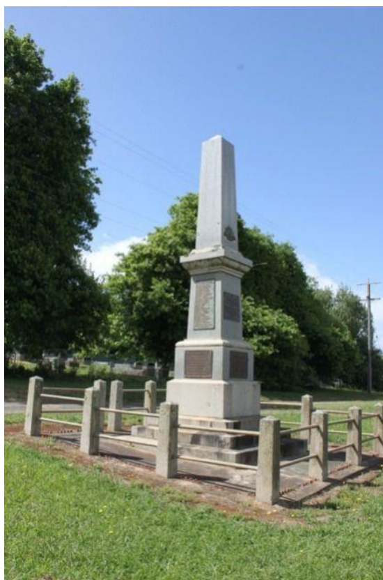
Neerim War Memorial